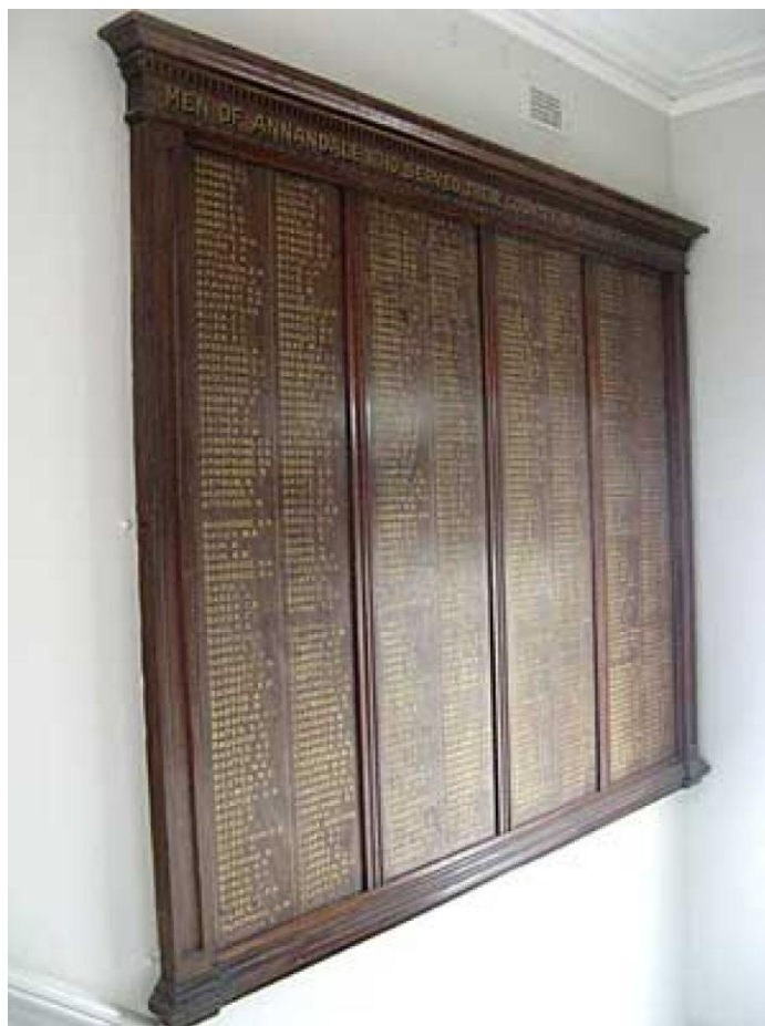
Annandale Great War Roll of Honour