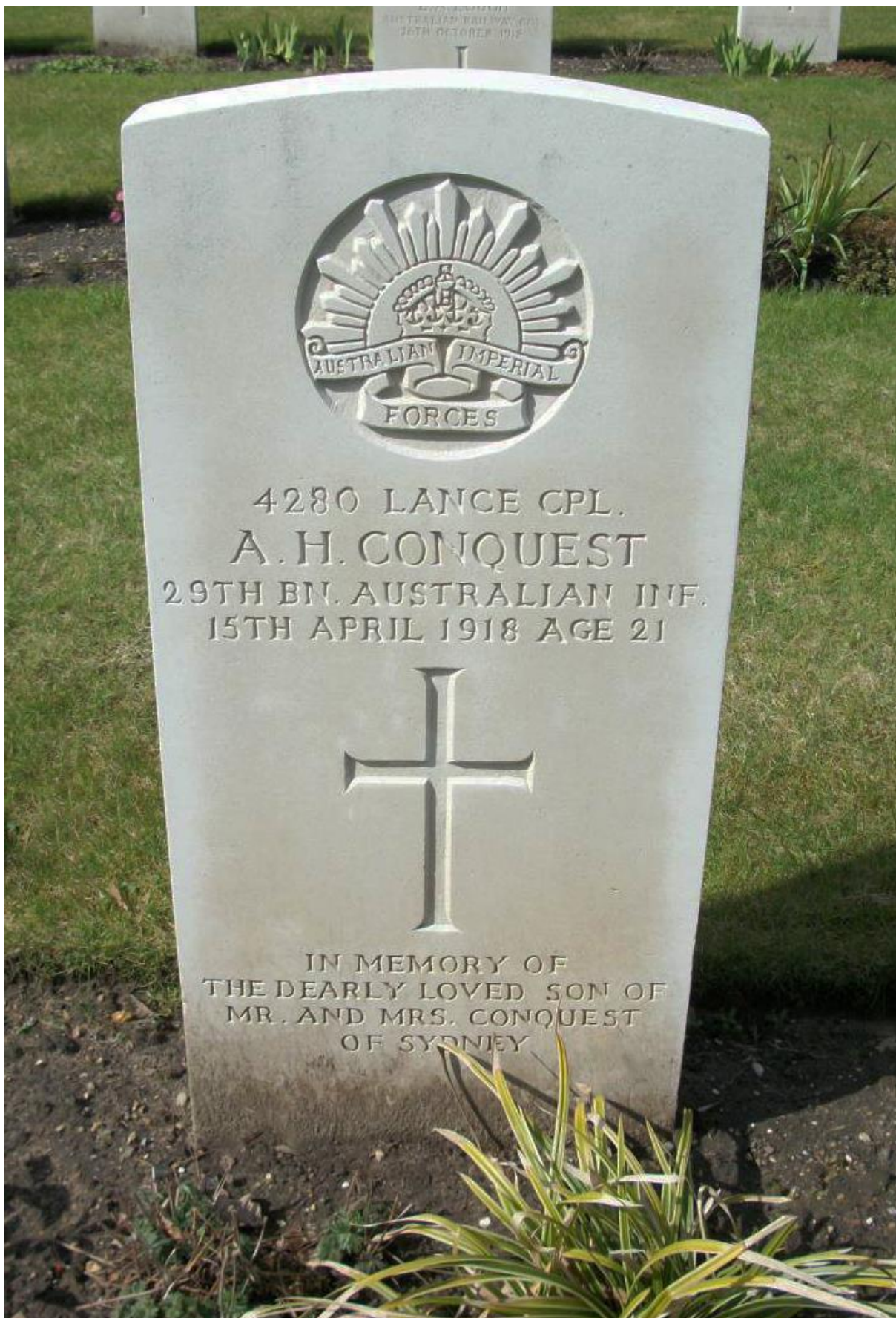
Photo of Lance Corporal A. H. Conquest's Commonwealth War Graves Commission Headstone in Brookwood Military Cemetery, Surrey, England.